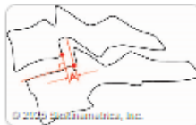
Figure C: Linear Translation Calculation Method

The method for measuring linear translation is to measure distance A as shown in Figure C, which is the same as the Relative Translation measurement for determining the distance A. On the patient's radiographs of the cervical spine motion segments, a dot is placed at the posterior superior corner of the lower vertebra, and a separate dot is placed at the posterior inferior corner of the upper vertebra. The distance (A) is measured as illustrated by Figure C, using two parallel lines. Measurements are obtained in flexion and separately in extension. 2,5-8 The patient's motion segment measurements are displayed in the Linear Translation Measurements table.